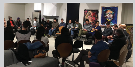
Computational Law + Blockchain Festival – Town Hall on Legal Tech and Tech Law at the Bushwick Generator