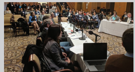
6 th Annual CUBE Legal Tech Innovators Competition

BLIP students also participated in the 6th Annual CUBE Legal Tech Innovators Competition, pitching several legal tech ventures. The Competition invited competitors from across NYC law schools to Brooklyn Law School. Perhaps most interesting, the Competition included the first ever “AI judge”, joining the panel of nine human judges. For this first year, the judgment (and potential biases) of the human judges trumped the “judgment” and potential biases of the AI judge.