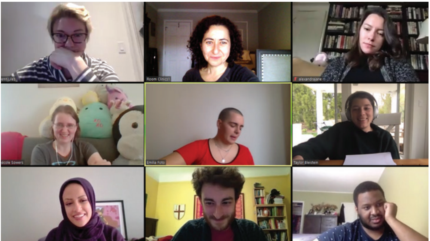
CDAC on Zoom