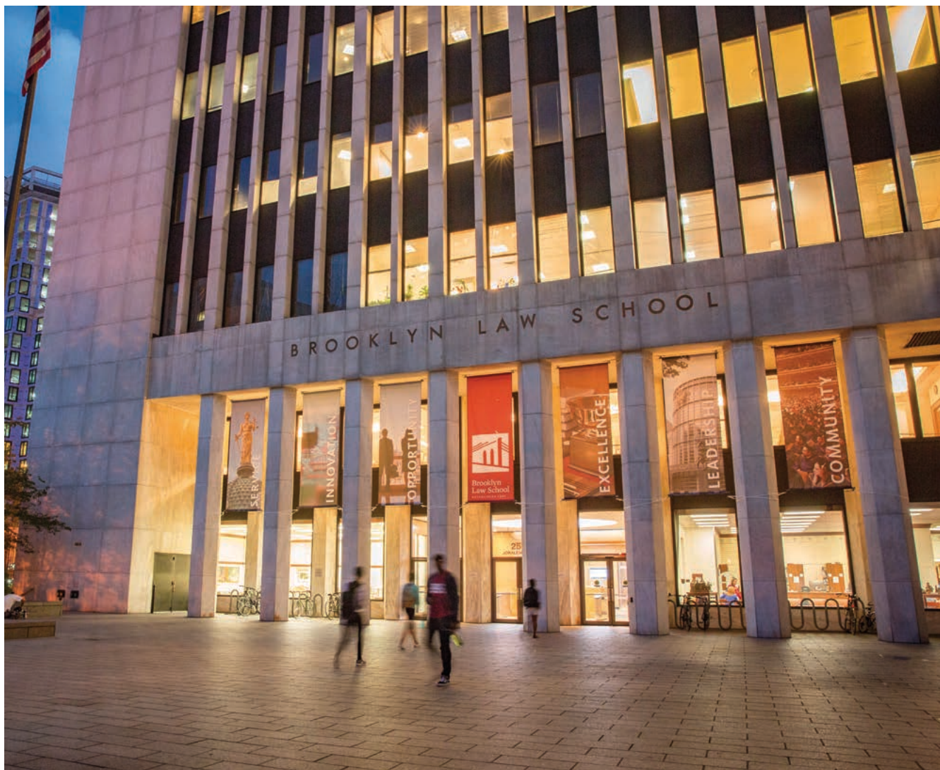
The Law School at night