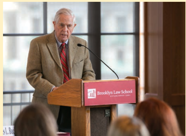
Hon. James L. Buckley discusses the impact of the decision on both campaign finance and the First Amendment.